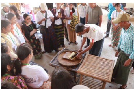
Training in bamboo culm care