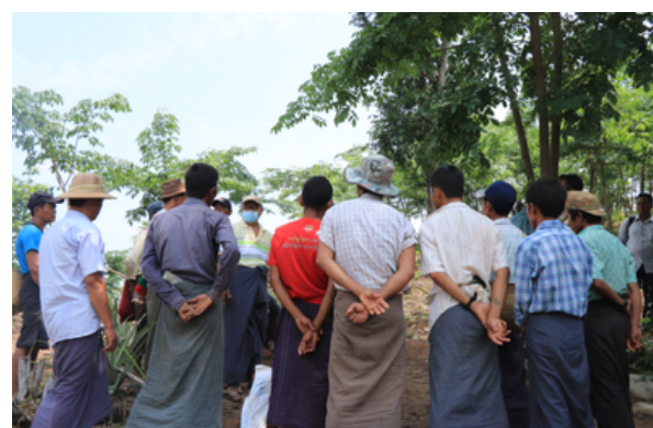
On-site demonstration of topography and soil conditions of Taungya cultivation