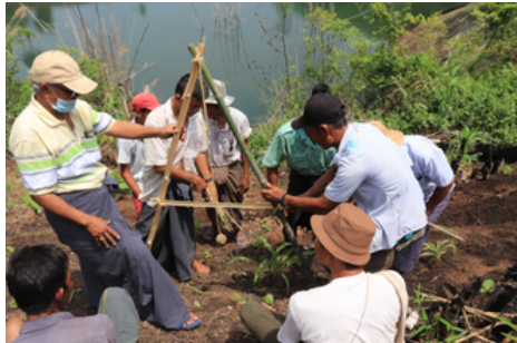
Demonstrating frame construction for terrace farming