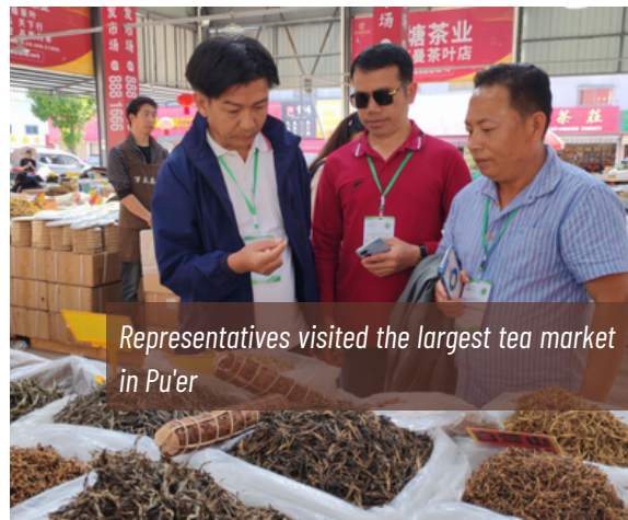
Representatives visited the largest tea market in Pu'er