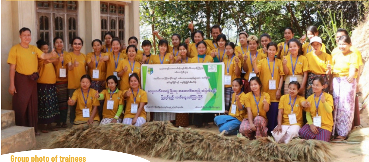
Group photo of trainees

The “Integrated Forest Ecosystem Management Planning and Demonstration Project in Greater Mekong Sub-region” project in Myanmar has already shown its impact through different types of training since 2021. From June 2021-2024, 10 in-project training courses were organized for around 300 people within the following three components.