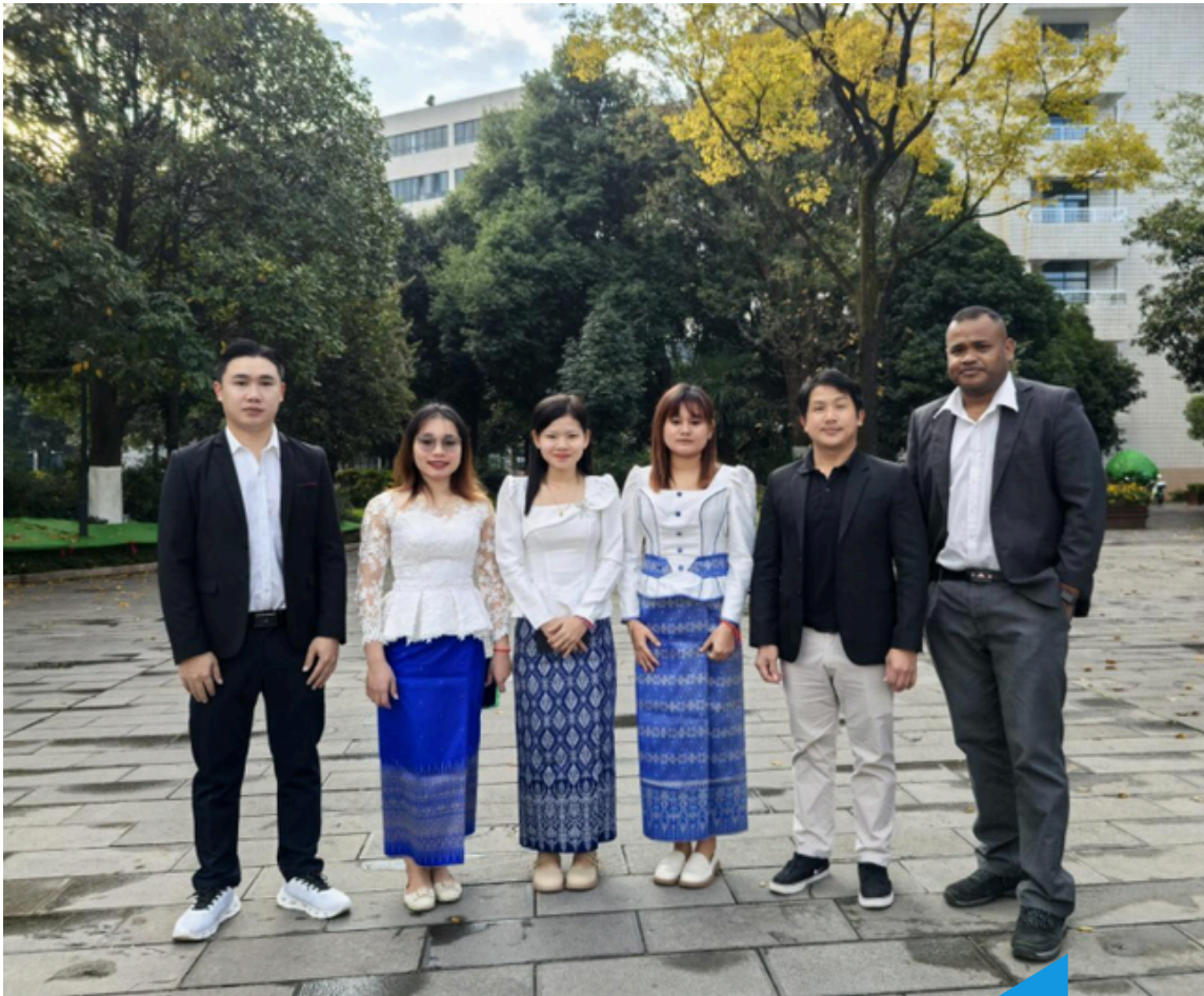
First batch of students of the "APFNet- Gu Jing Gong Lingzhi Scholarship Program"

In June 2024, APFNet, in partnership with Gujing Gong Lingzhi Ltd., Southwest Forestry University, and Hainan Nature Foundation, established the "APFNet- Gu Jing Gong Lingzhi Scholarship Program". The program mainly supports young forestry officials and scholars from Cambodia and Laos to pursue Master's degrees in forestry at Southwest Forestry University (SWFU), China. Six students enrolled in this fall have started their two-year campus life.