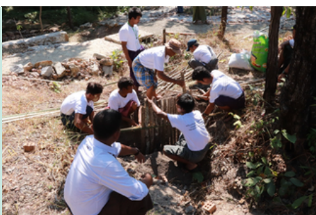
Field practice on bio-fencing for soil erosion control