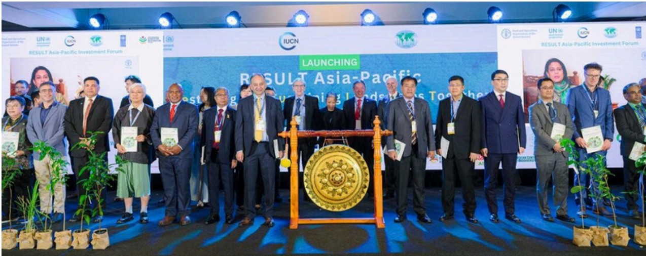
The launch of RESULT Asia-Pacific framework.

The Soil and Water Forum 2024, held from 9 to 11 December 2024 in Bangkok, was the platform for launching the “Restoring and Sustaining Landscapes Together (RESULT) Asia-Pacific” framework. This launch marked the beginning of a coordinated regional effort to restore and sustainably manage 100 million hectares of degraded landscapes across 20 economies in Asia and the Pacific by 2030.