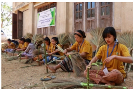
Training in grass broom making