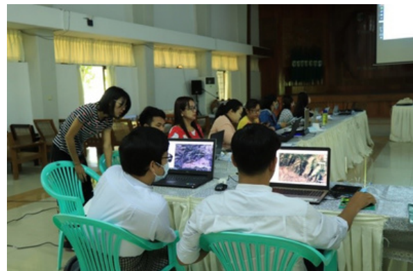
Training in three-dimension mapping and map composition