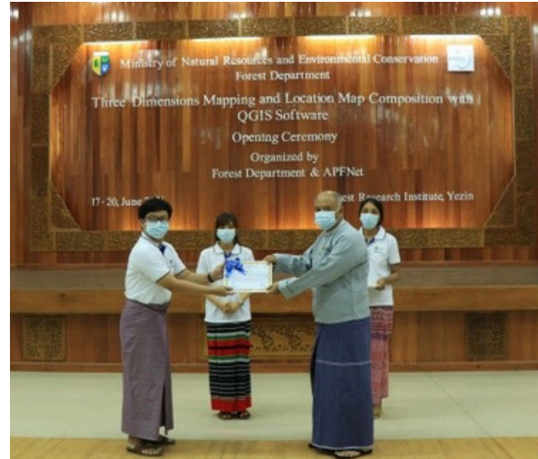
Training certificate awarding ceremony