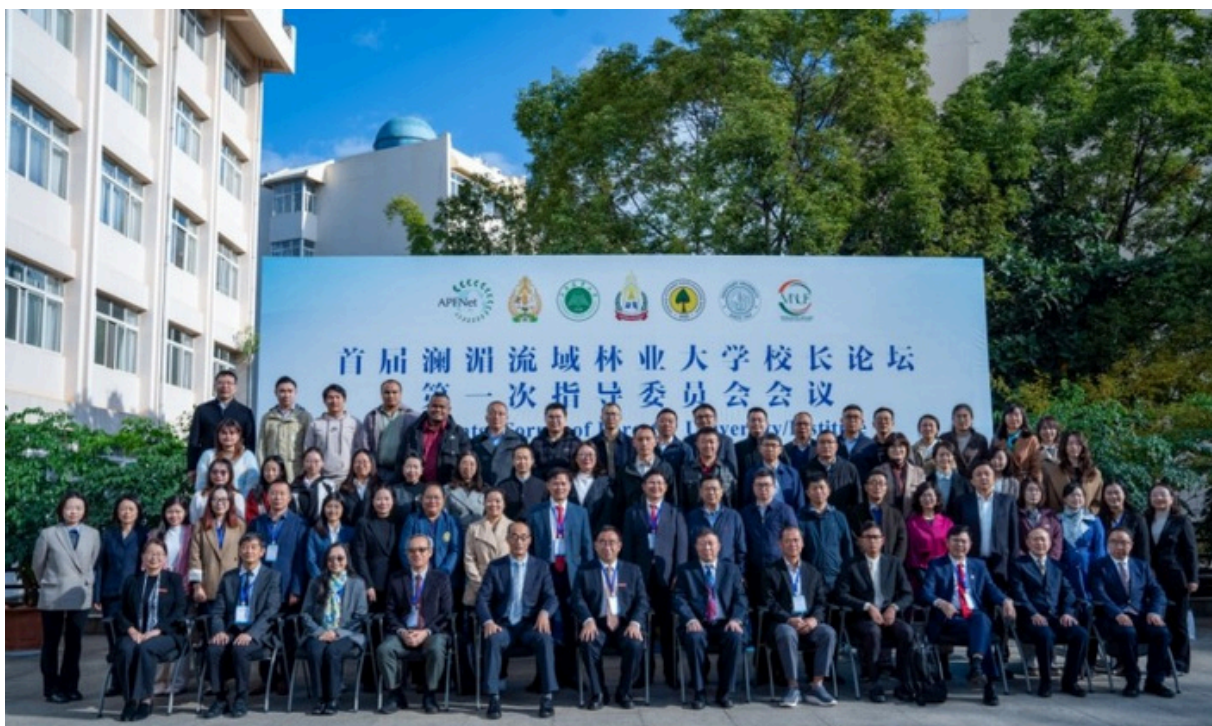
Group photo of the Steering Committee

On 19 November 2024, the first Steering Committee Meeting of the Presidents' Forum of Forestry Universities and Institutes in the Greater Mekong Sub-region (GMS) was held in Kunming, China. Representatives of forestry universities from Cambodia, China, Laos, Myanmar, Thailand and Vietnam deliberated on future regional cooperation in higher forestry education and talent development.