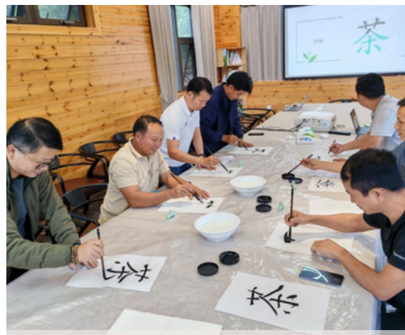
Representatives experienced Chinese tea culture by writing Chinese character of "tea"