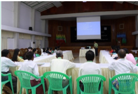
Lecture for village leaders