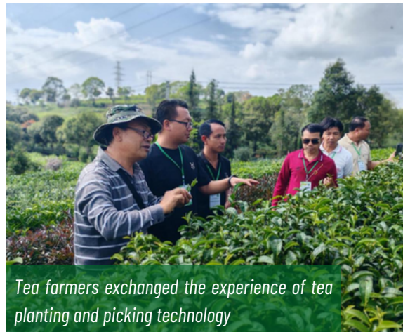
Tea farmers exchanged the experience of tea planting and picking technology

The field training is one of the action plan achievements of the Pu'er Forum, with aiming to promote regional technical exchanges in the area of the tea farming, deepen cooperation, and contribute to regional tea industry and rural development. The training is sponsored by APFNet and organized by Southwest Forestry University, with technical support from APFNet Kunming Center, Forestry and Grassland Administration of Pu'er City, etc. Representatives from other GMS economies will be invited in the future.